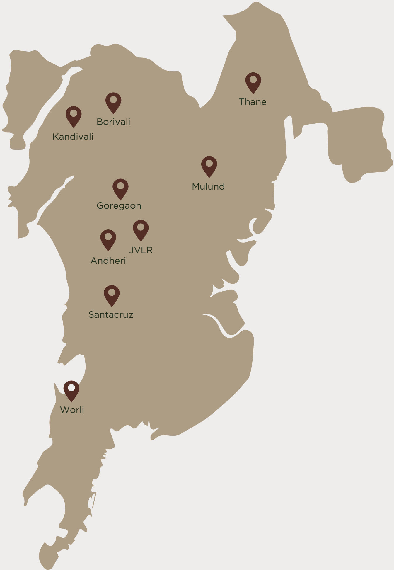
Map For Representation Purpose