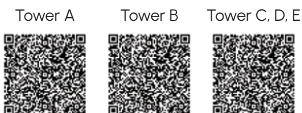
MahaRERA QR Codes